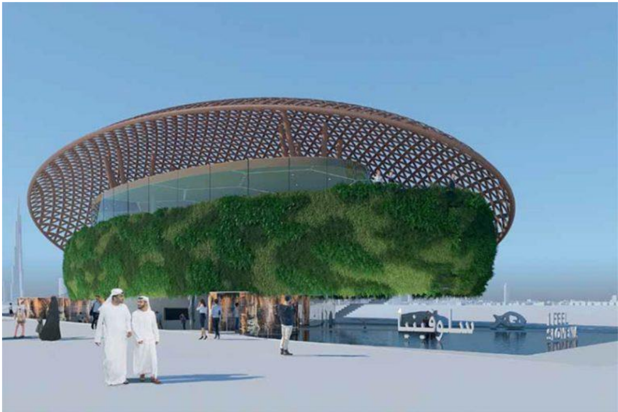
EXPO 2020 DUBAJ: avtor Magnet Design (Robert Klun), render Magnet design