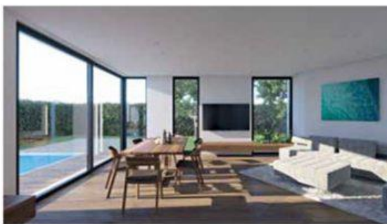
VILA TRNOVO: avtor Magnet design (Robert Klun), render Magnet design